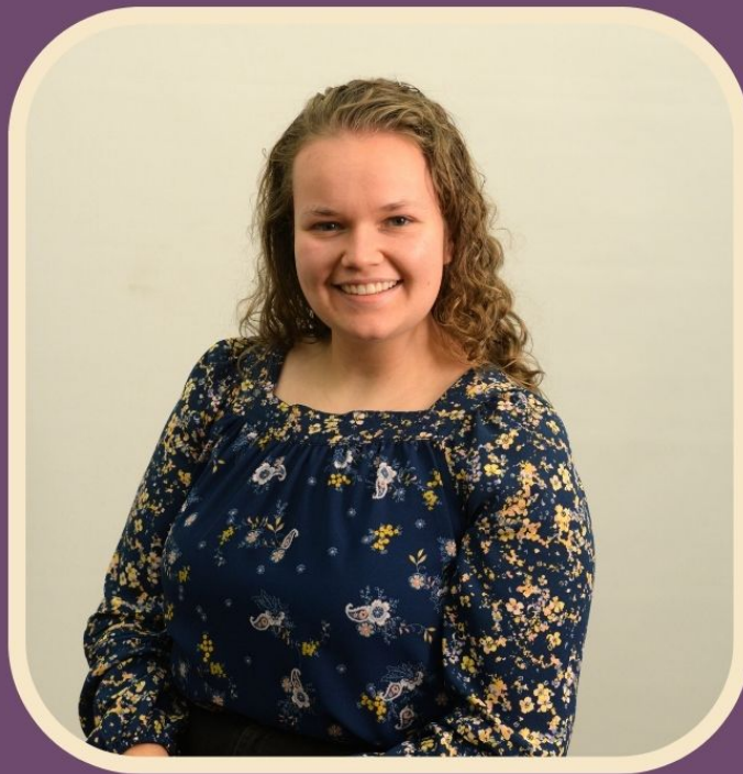
University of Pittsburgh, '23

BI provided me a community where I could be curious about the faith, ask questions, and invite others to join. Since graduation, I have been able to incorporate these aspects into my workplace by reaching out to coworkers, creating an environment where others feel comfortable asking questions about Christianity, and continuing to seek out communities where I can stretch myself and grow deeper in my faith.