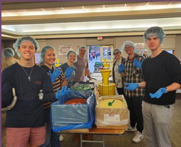
Fellows and staff helped Amen to Action pack one million Thanksgiving meals for Western Pennsylvania residents.