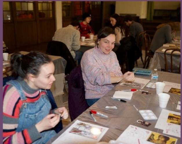
Students practiced how to integrate prayer and painting in the Iconography Workshop.