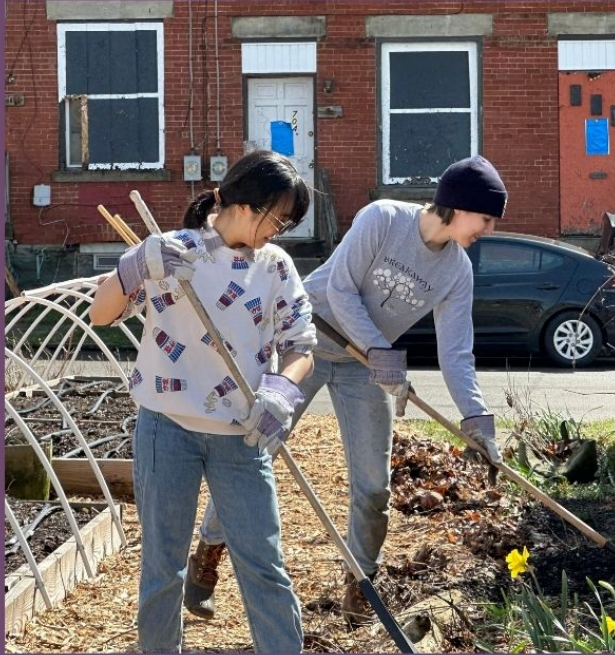
Fellows tilling flower beds at Oasis Farm and Fishery, helping the farm transition from winter into spring.